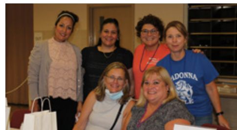
Trivia Night volunteer committee takes time for a photo

The Madonna Foundation Trivia Night is back! On Friday October 1, over 120 alumnae, family and friends gathered at Resurrection High School for the annual Trivia Night. Everyone enjoyed the games, raffles and connecting with one another throughout the night during this friendly competition. Mark your calendars for November 19, 2022 and get your teams together. Be sure to visit our website, www.madonnascholars.org or call 331.318.5170 for more details.