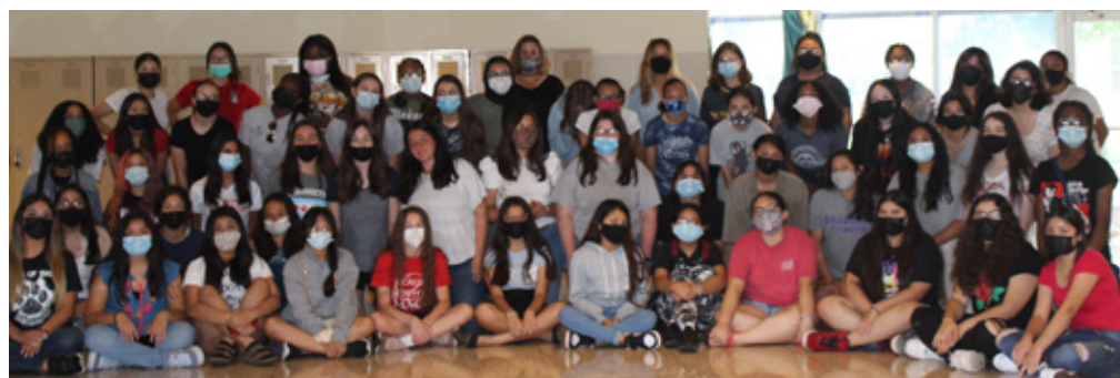
Pictured above are the Madonna Scholars at Family Orientation

All 12 Madonna seniors graduated this spring and will attend college in the fall. Their hard work and dedication resulted in multiple acceptances and scholarship offers from colleges and universities coast to coast! The aggregate total of scholarship offers was more than $6,800,000.