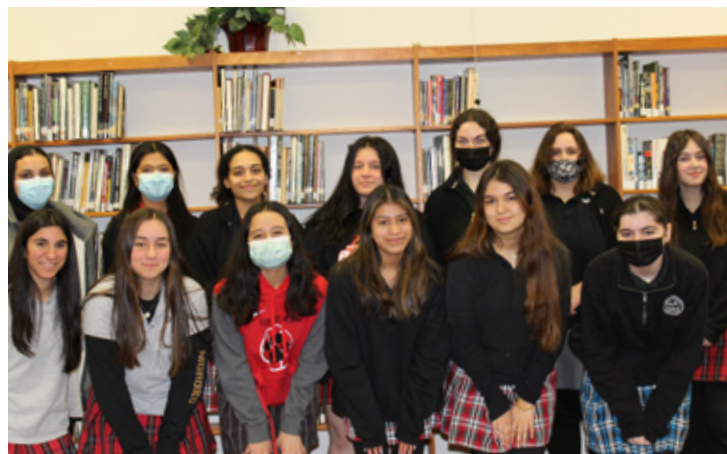
Madonna Scholars at Resurrection High School