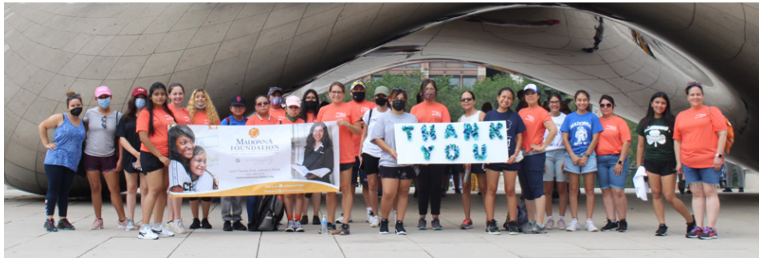
Pictured above are Madonna Scholars and families at Millennium Park