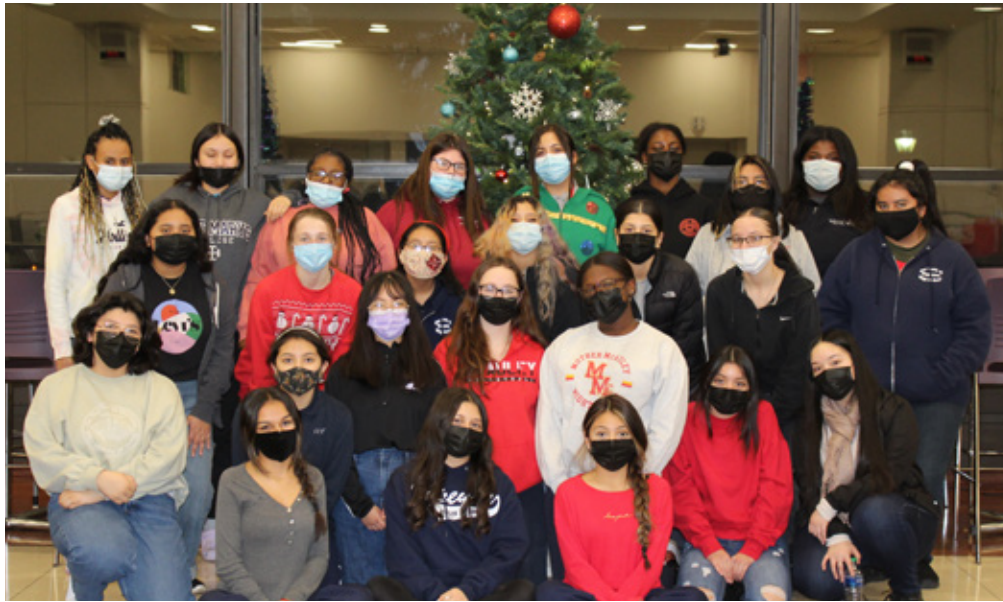
Pictured above are the Madonna Scholars after they completed their service project

To instill and foster the spirit of giving back, scholars participated in our annual service projects. In December, Madonna scholars created beautiful hand-made tie blankets for the families at St. Jude House, our domestic violence shelter in Crown Point, Ind. The students also created heartfelt Christmas cards for the Franciscan Sisters and residents of the Mother Theresa Home.