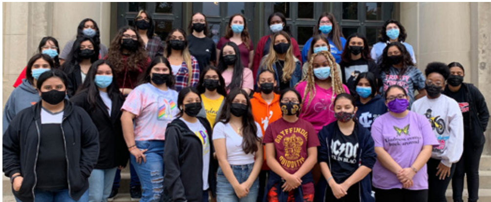
Students and parents enjoyed the visit and tour at Mount Mary College

The Madonna Foundation was thrilled to have the opportunity to bring over 75 students and family members to visit Mount Mary College in Wisconsin in September. As the two-year pandemic has abated and most restrictions have lifted, this college visit was able to be conducted in-person, enabling scholars and their families to explore the campus and get a real feel for the college environment.