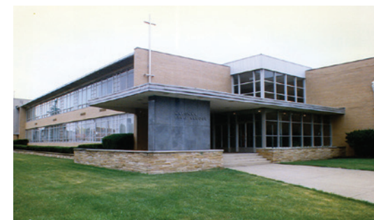
Madonna High School.

Seventeen freshmen were selected for the 2019-2020 school year. We also welcomed back fifteen sophomores, fifteen juniors and thirteen seniors.