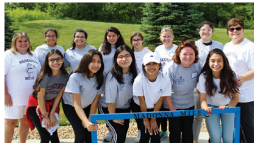
Madonna Mile volunteer committee with current Madonna scholars.

The Madonna Foundation, as part of Franciscan Community Benefit Services Corporation, was blessed to be one of the 18 charities at First Look for Charity, the premier black tie event of the Chicago Auto Show held on February 7 at McCormick Place. We welcomed more than 600 guests and supporters in our private hospitality suite. Because of the generosity of our sponsors and donors, the Madonna Foundation can provide support to more young women in need.