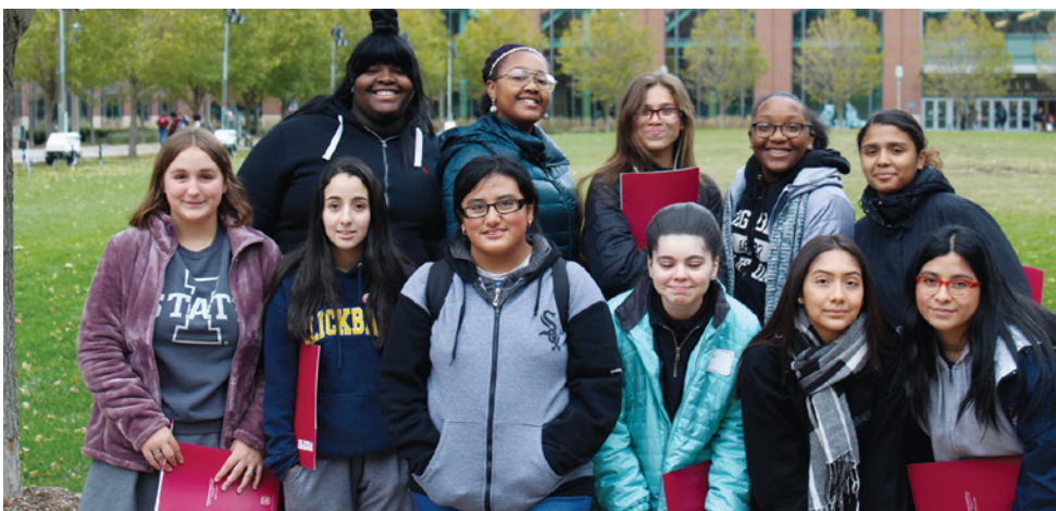
Madonna scholar sophomores enjoy their leadership workshop hosted by the Gannon Scholars at Loyola.

The Madonna scholars visited the campuses of St. Xavier University and Loyola University. In addition to learning about the admissions process, they got a sense of the unique environment of each school through leadership workshops, presentations for first-generation and minority students and conversations with professors and student leaders. Our third college visit to Illinois State University scheduled for April was cancelled due to the pandemic. However, our students had the opportunity to participate in a virtual ISU college tour. This interactive tour allowed the students and parents to ask questions of the faculty, staff and student leaders at ISU. We encourage scholars' parents to participate to help them understand college preparedness.