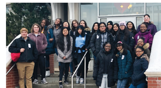
Madonna scholars and families volunteer at Misericordia Heart of Mercy.