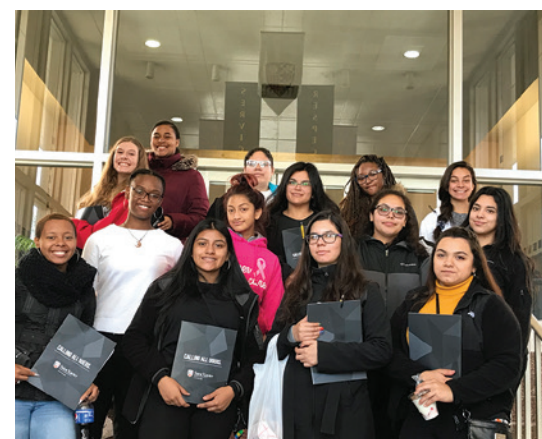
Madonna scholars during their college visit to St. Xavier University.

In April, Madonna scholars created beautiful hand-made thank you cards and wrote words of encouragement for our dedicated staff of heroes working in all of our senior living communities, ensuring our residents care and safety during the pandemic.