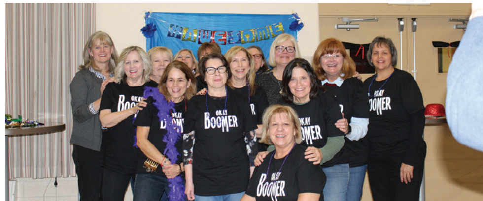
MHS class of 1977 enjoying the fun at Trivia Night.

The second annual Trivia Night welcomed over 175 guests on February 29 at Resurrection High School. Alumnae and friends gathered with Madonna scholar families for the friendly competition. While enjoying food and drinks and meeting old friends, teams tested their trivia knowledge to benefit the Madonna Foundation. Save the date (February 27, 2021) for next year's Trivia Night and get your team together! Thank you, Resurrection High School for hosting and the MHS Alumnae planning committee for creating this fun-filled night!