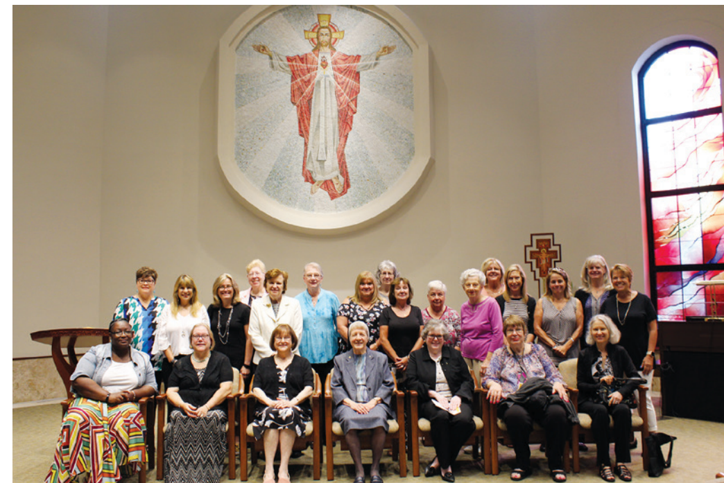
Madonna High School Alumnae and former teachers.